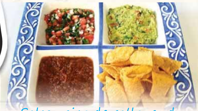
Salsa, pico de gallo, and guacamole